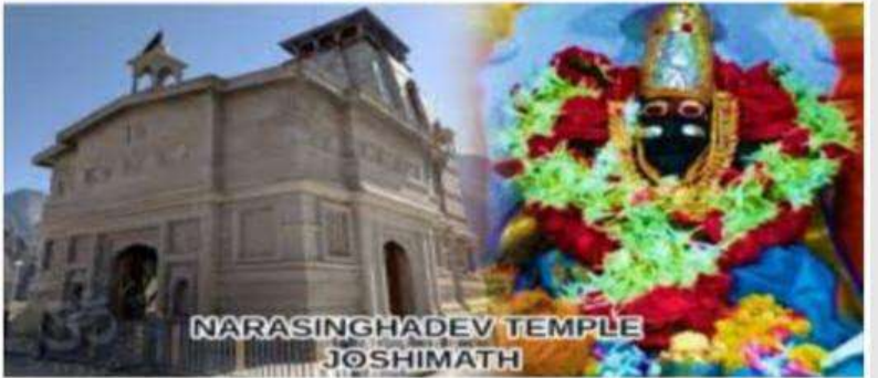
NARASINGHADEV TEMPLE JOSHIMATH